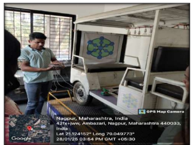
Trainer demonstrating Wireless charging of Electrical vehicle