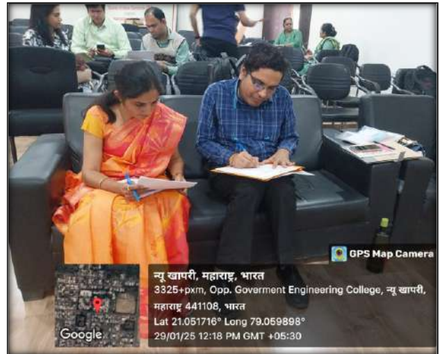
Participants in a group discussing research articles allotted to them