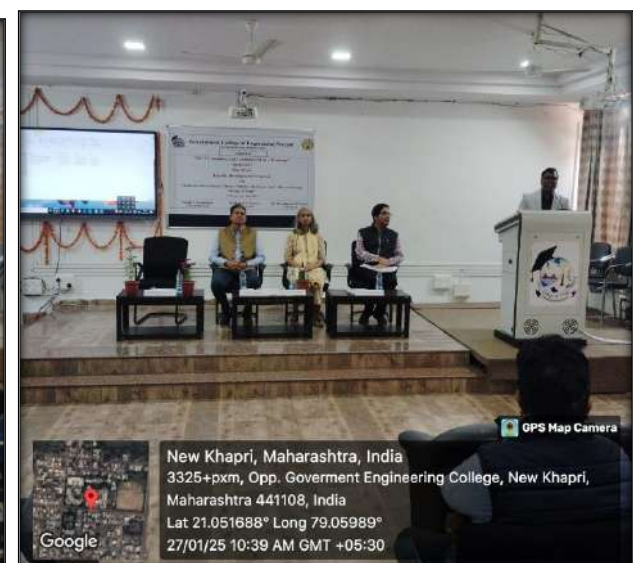
ATAL FDP Coordinator giving insights about the FDP and Group photo during Inaugural Session