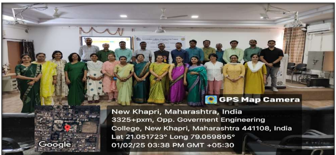
Group photo after valedictory session of AICTE ATAL FDP